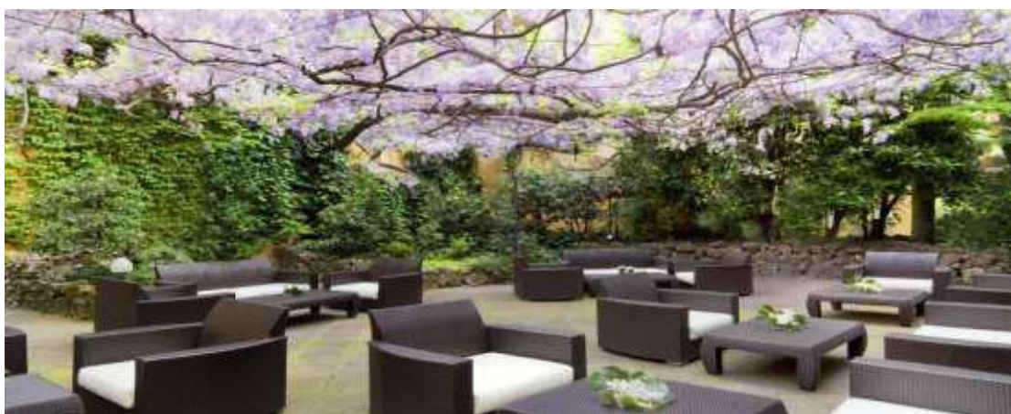
H Club Diana

On Tuesday we spent an evening at the H Club Diana, the place to be for an authentic Milanese aperitif in downtown Milan, located in a lovely green garden. A unique retreat in the center of Milan. The club is located in one of so-called "Milanese Movida" centers. Nearby are located Corso Buenos Aires, where large department stores and cheap clothing and shoe boutiques are, and Milan's Fashion District, where a large concentration of haute couture labels are.