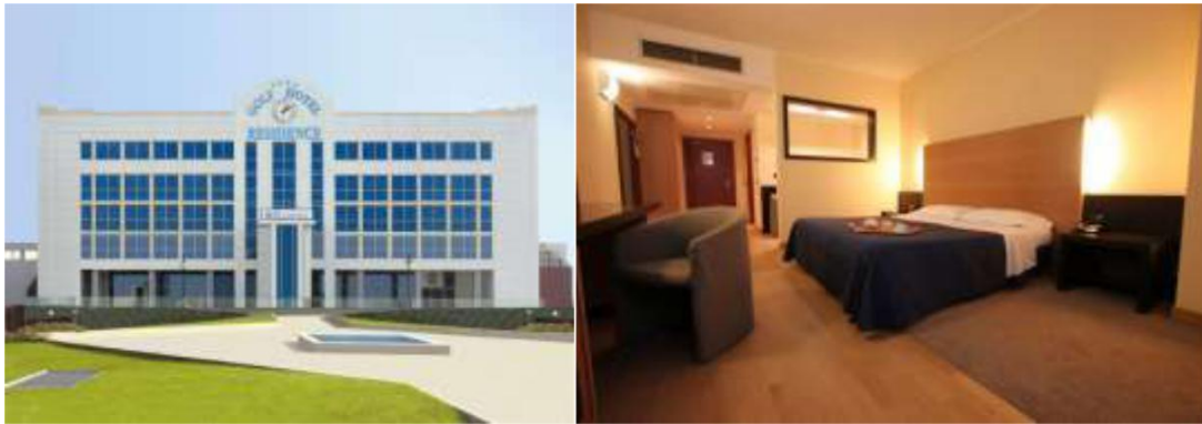
Golf Hotel Milano

Golf Hotel Milano is strategically located; 10 minutes from Humanitas University, 15 minutes from Milan Linate and 15 minutes from downtown Milan. Among the common areas, all in a minimalist style and elegant with a touch of rustic to make its environment warmer, there are a breakfast room, a lounge bar that offers a space dedicated to happy hours, a sun-downer, a roof garden and an internet point to make your stay more comfortable.