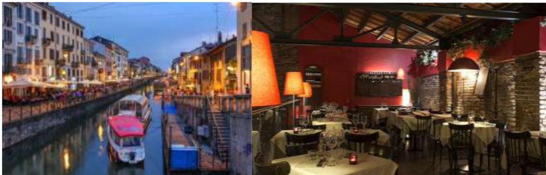
Navigli District and Officina 12

On Wednesday we had dinner at the restaurant Officina12 where the history of old Milan blends with an international contemporary touch. The cuisine is always in the pursuit of the highest quality and uses seasonal ingredients and local products. Officina12 is situated in the heart of the Navigli district, one of the most famous areas of Milan; charming and base of the Milan nightlife.