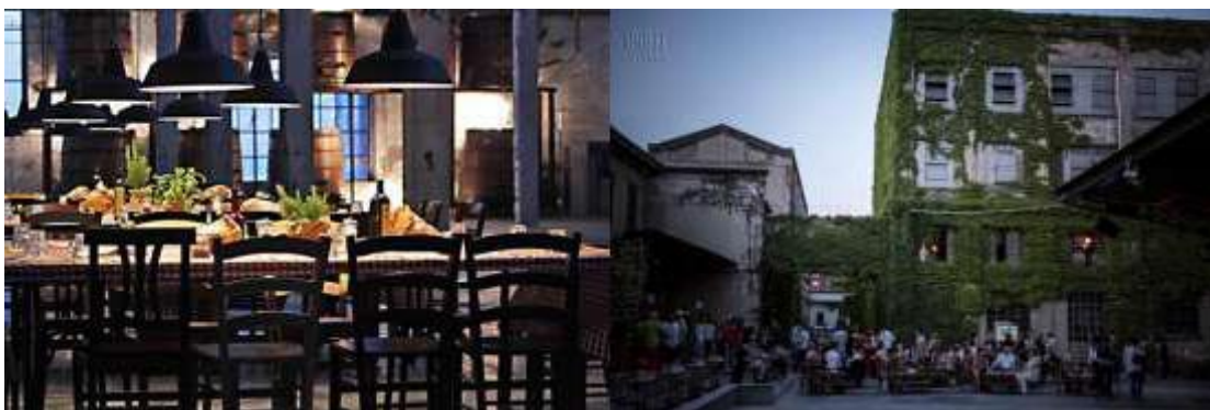
Spirit De Milan

Thursday evening, we had dinner at an old crystal glasswork fabric 'Cristallerie Livellara'. Nowadays this place, called 'Spirit de Milan', has become a dance floor, a theatre, a stage, a restaurant, a hangout and a new home for passions. In the bistro-restaurant you may find genuine and soothing homemade food, regional appetizers, chilled drinks and, most of all, good wine.